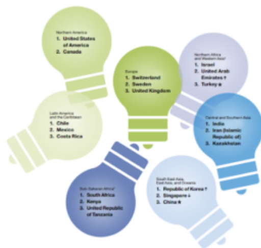
Top three innovation economies by income group